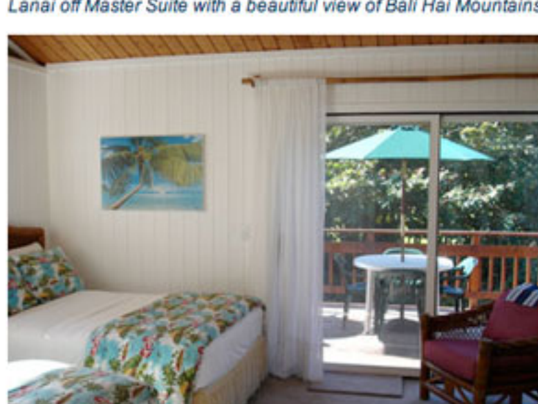
Second suite also has Lanai and Beautiful views