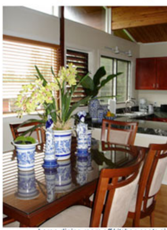
Large dining room off kitchen seats six