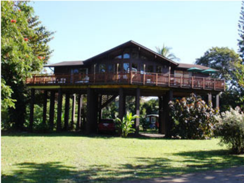
View of Home surrounded by the large tropical yard