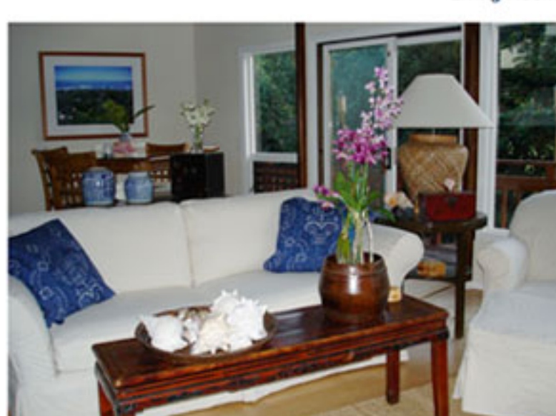
High bistro table also in livingroom