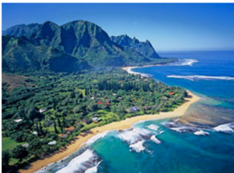
Aerial view of beautiful Haena where Alohilani is located

The home looks out onto over three hundred untouched acres of natural jungle and pasture with the Bali Hai Mountains as a background.