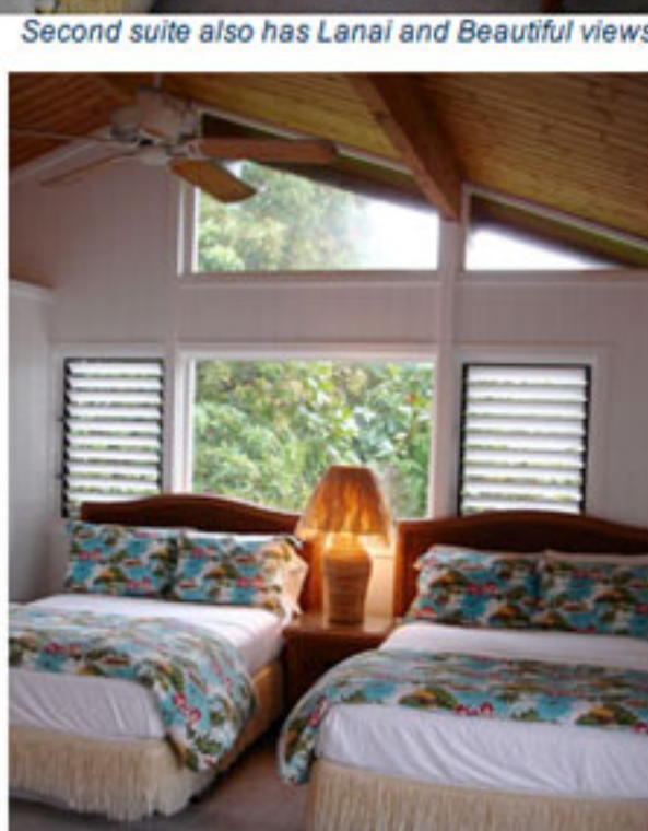
Two Full Size Beds in second suite