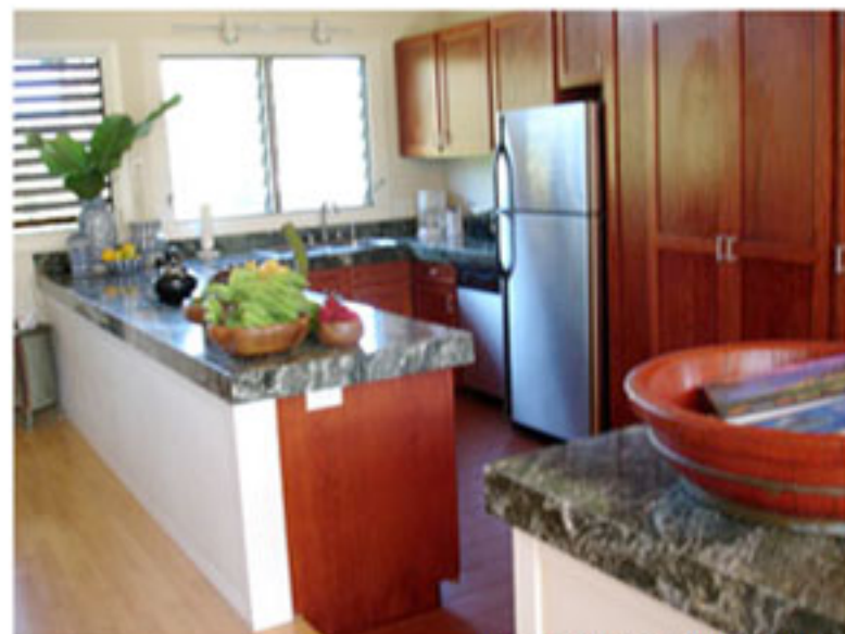
Large well appointed kitchen