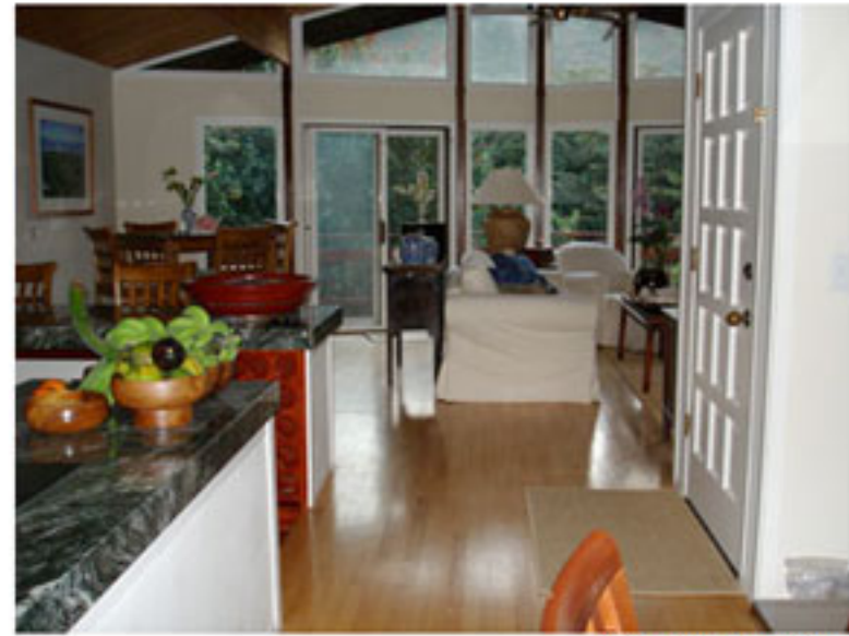
Spacious Floor Plan