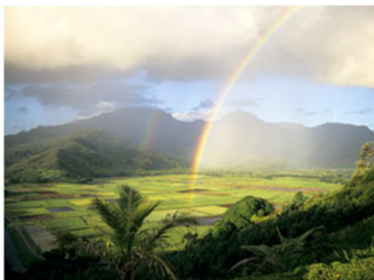
View of Hanalei Valley on way to Alohilani

This lovely home named Alohilani (Hawaiian translation-Brightness of Heaven) is located in beautiful rural Haena, the most sought-after location on the Garden Island of Kauai. Alohilani is a short stroll to some of the most picturesque and pristine beaches in the entire world.