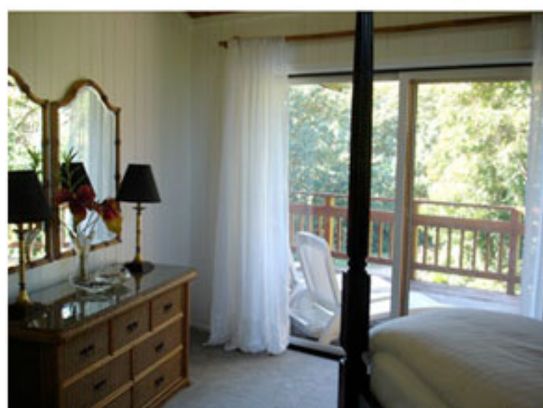
Looking onto Lanai off Master Suite