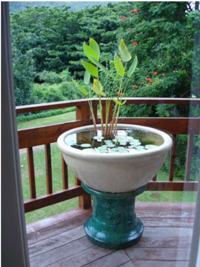
Lanai Lilly Pond off Living Room